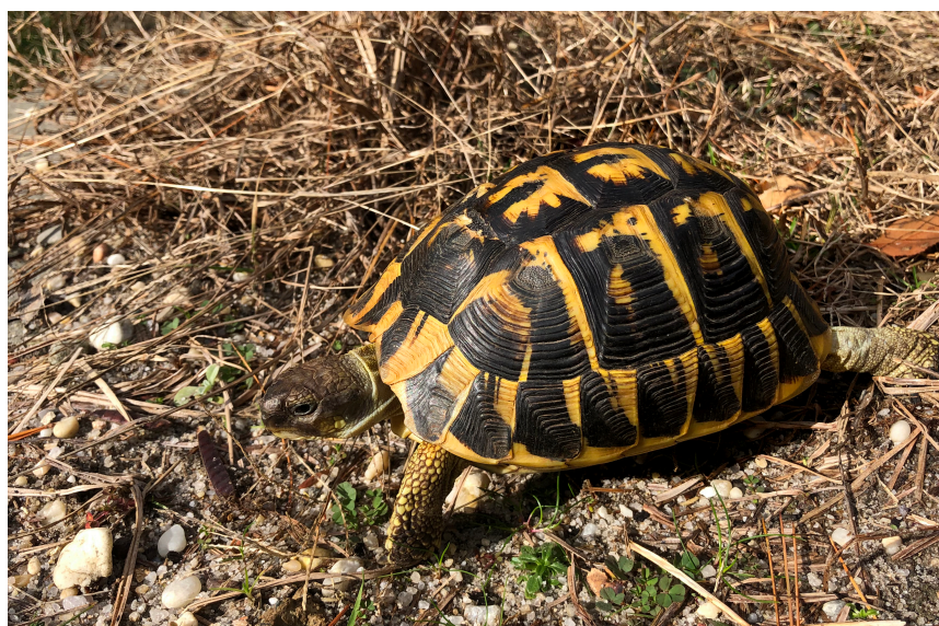
Figure 3. Adult female Testudo hermanni hermanni from Varoise, France (MU3).