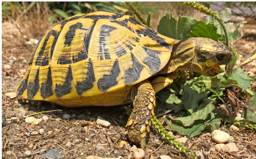
Figure 2. Adult female Testudo hermanni hermanni from Ragusa, Sicily (MU2).