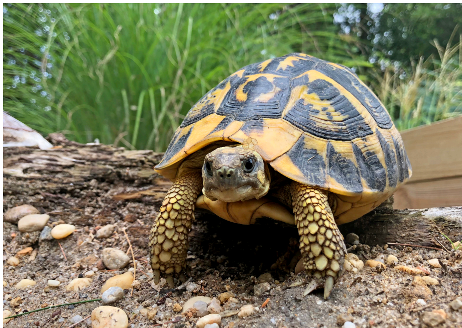
Figure 1. Adult female Testudo hermanni hermanni from Apulia, Italy (MU1).