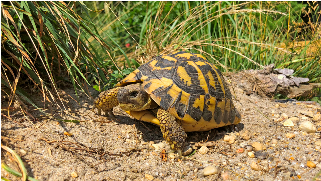
Figure 4. Adult female Testudo hermanni hermanni from Minorca, Spain (MU4).